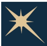
Figure – STARR Kiosk Icon

From a County kiosk workstation, click on the STARR icon to open the application. Your session will be authenticated automatically and take you directly to the STARR home page. From the home page, you will be able to search for publicly available probate records.