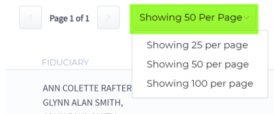
Figure – STARR Record Count Selector (Expanded)

To navigate between groups, users can press the 'Next Page' or 'Previous Page' buttons located at the top and bottom of the Matching Results section.