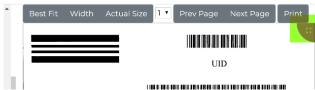
Figure – STARR File Details Screen Image Viewer – Full Screen Icon

From full screen mode, click the 'Dock' icon to return to the default mode where the image viewer is docked to the right of the File Details.